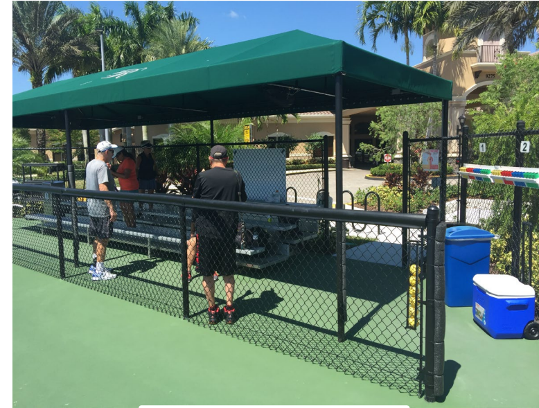
Boynton Beach Florida