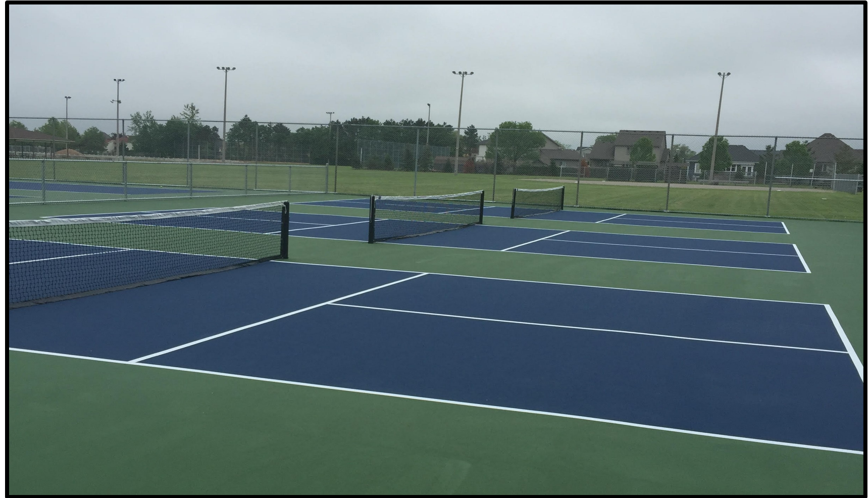
Virgil, Ontario May 2019